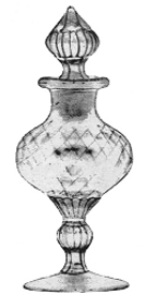
No. 516 1 OZ. COLOGNE DIAMOND OPTIC W/ No. 76 STOPPER ALSO MADE PLAIN

No. 516 Fairacre Picture: Bredehoft/p. 315 Date of production: 1922-1933 Size: 1 oz. Color: Crystal, Moongleam, Flamingo, Hawthorne - Plain and Diamond Optic Marked: Sometimes on bottom Stopper: No. 76