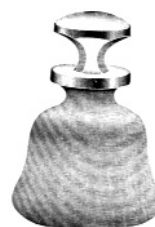
No. 1184 - 4 OZ. COLOGNE No. 65 DRIP STOPPER ALSO MAKE 2 OZ. SIZE

No. 1184 Yeoman (no panels) Picture: Vogel B2/p. 148 Date of production: circa 1915 Size: 2 & 4 oz. Color: Crystal Marked: On stopper only Stopper: No. 65