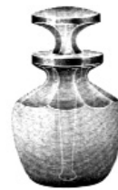
No. 493 - 2 OZ. COLOGNE WITH No. 65 STOPPER

Nos. 493, 494 Round (short panels at top) Picture: Vogel B2/p. 148 Date of production: 1920 Size: 2 oz. Color: Crystal Marked: Yes, under the lip Stopper: Nos. 65 & 61