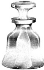
No. 354 - 6 OZ. COLOGNE GROUND BOTTOM CUT OR PRESSED STOPPER

No. 354 Wide Flat Panel Picture: Vogel B2/p. 148 Date of production: 1908-1930 Size: 6 oz. Color: Crystal Marked: Twice on stopper/ twice on neck Stopper: Cut or pressed