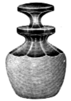
No. 494 - 2 OZ. COLOGNE WITH No. 61 STOPPER