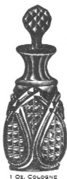
1 OZ. COLOGNE